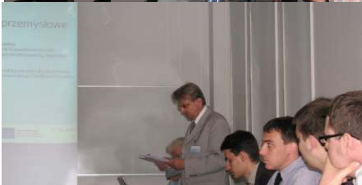
Beginning of the seminar.